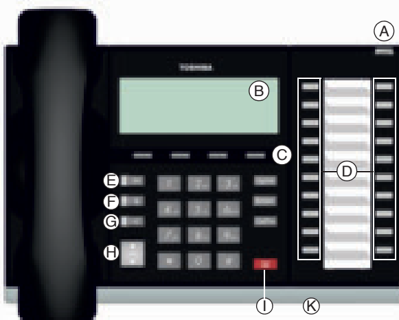
20 Programmable Feature Buttons 4-Line LCD