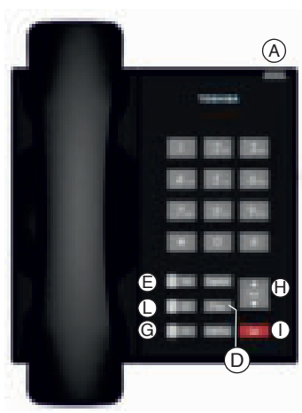
Single Line Telephone 1 Programmable Button